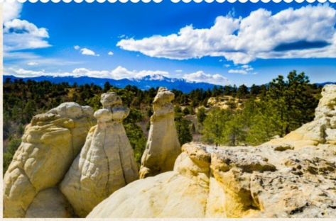
Palmer Park, Colorado Springs

September 9, 2023 8am-noon Maizeland/ Academy Entrance