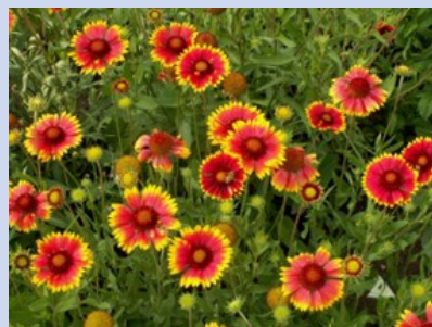
Featured Native Plant Blanket flower, Gaillardia aristata

Concrete Couch will host a day of celebration and service in honor of Martin Luther King Jr. - Until the Dream Becomes Reality - with food, free creative activities, and more! The event will be held at Concrete Coyote, 1100 S. Royer, CS, CO, 80903. Join our community in remembering and giving back!