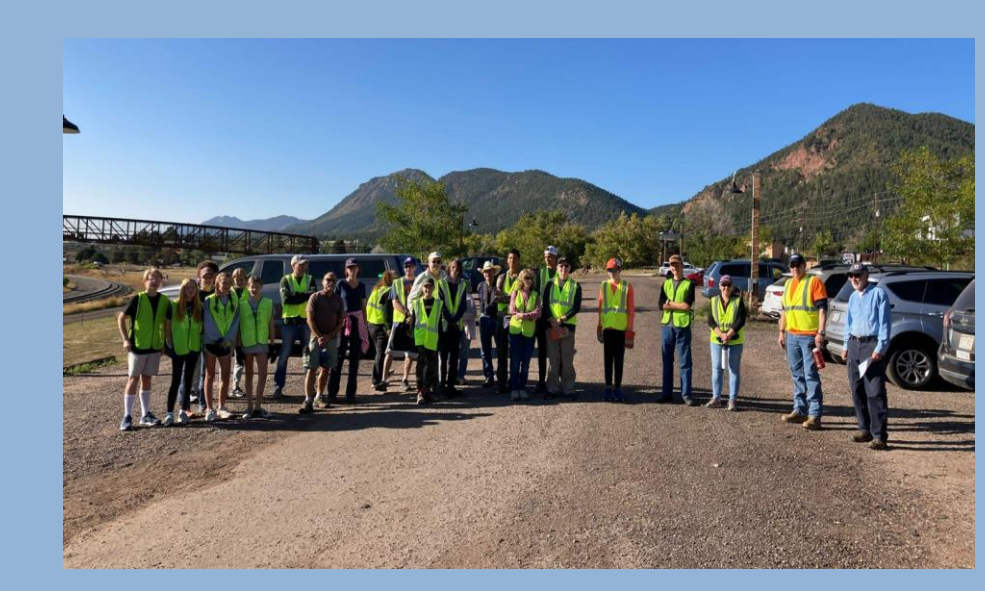
Palmer Lake Parks Commision and Friends