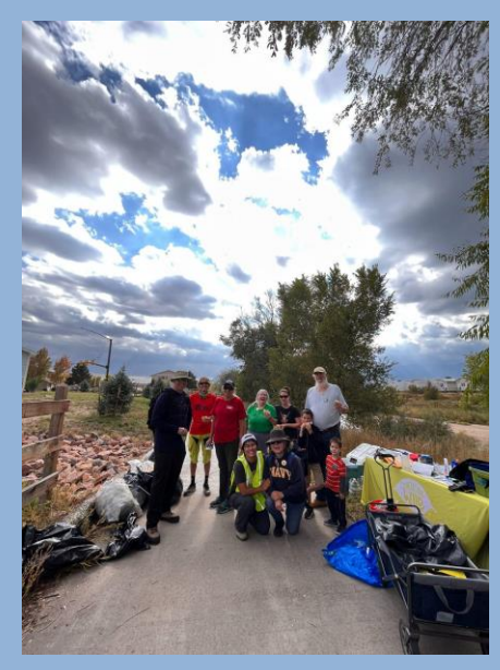
Sassy Sand Creek Snapping Turtles