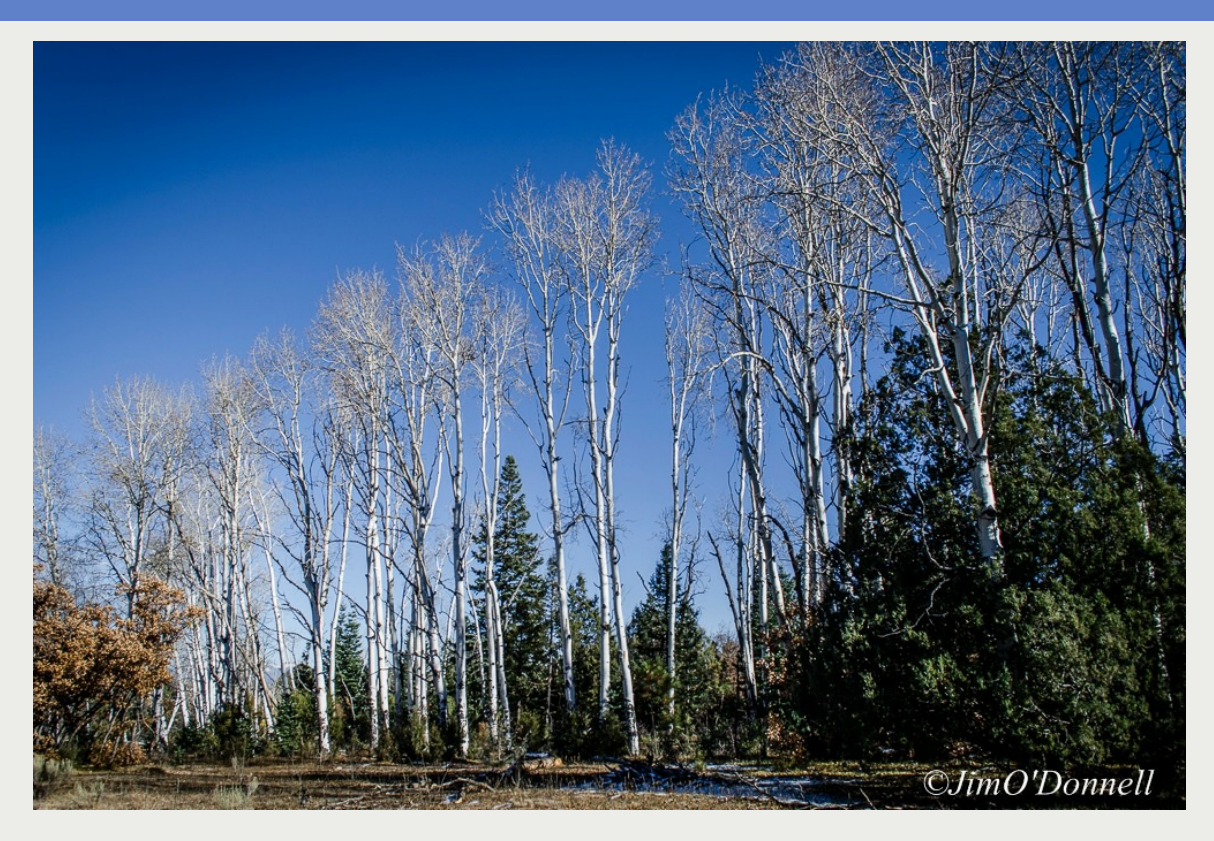
The Fountain Creek Watershed District works from Palmer Lake to Pueblo to protect and enhance the health of the watershed.

Welcome! We're excited to share with you the latest updates and engaging stories about this crown jewel. Let's dive in!