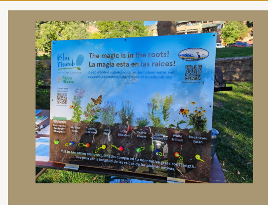
FCWD's new Native Roots educational display.