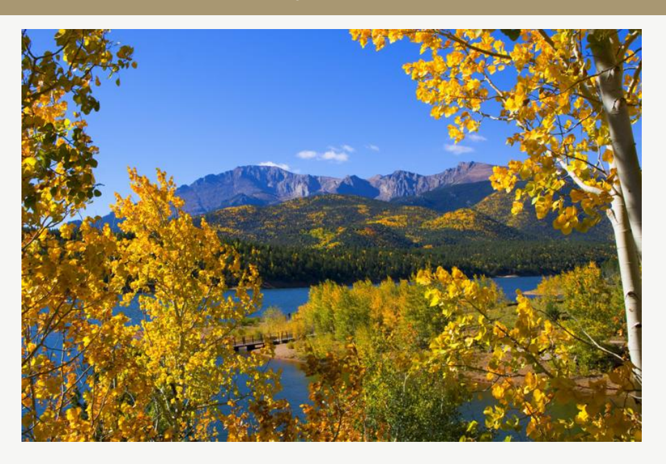
Pikes Peak in fall.

Welcome! We're excited to share with you the latest updates and engaging stories about this crown jewel. Let's dive in!