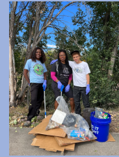
RISE YAC, Generation Wild, & Backpackers Sand Creek Trail 2022