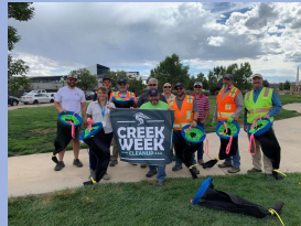
City of Colorado Springs Stormwater Enterprise 2022