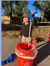
Aprivida Cleanup Crew 2022

Pick a time, pick a day, and pick it up! General registration will open around August 15th. Crew Leaders will reserve a cleanup site and coordinate with their team. Crew Members will visit the registration map, select a cleanup site with a crew leader already assigned, and email the crew leader to join the crew.